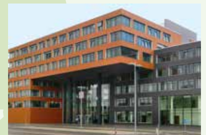
Main building (Evonik)

→ Please register in the main building (Evonik) of the Industriepark Wolfgang on arrival.